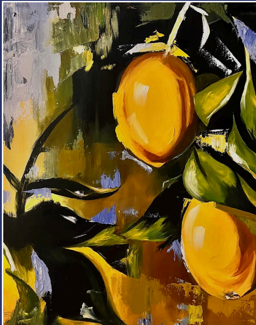
Artwork by Habiba Al Ayouti DP12R